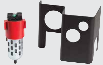
Eliminer filter and cover