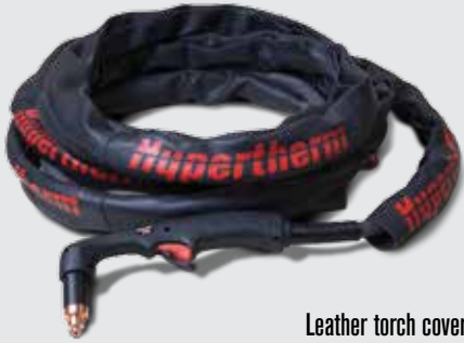
Leather torch cover